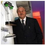
› Ernesto Gismondi