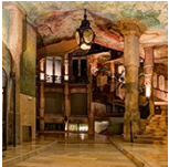
› La Pedrera