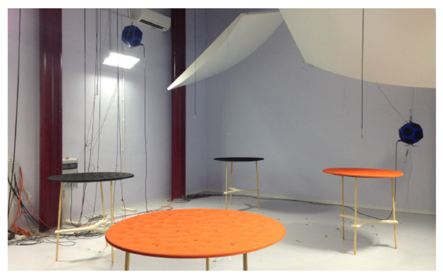
Figure 2: Arrangement of the 4 Silent Field 2.0 lamps in reverberant chamber.