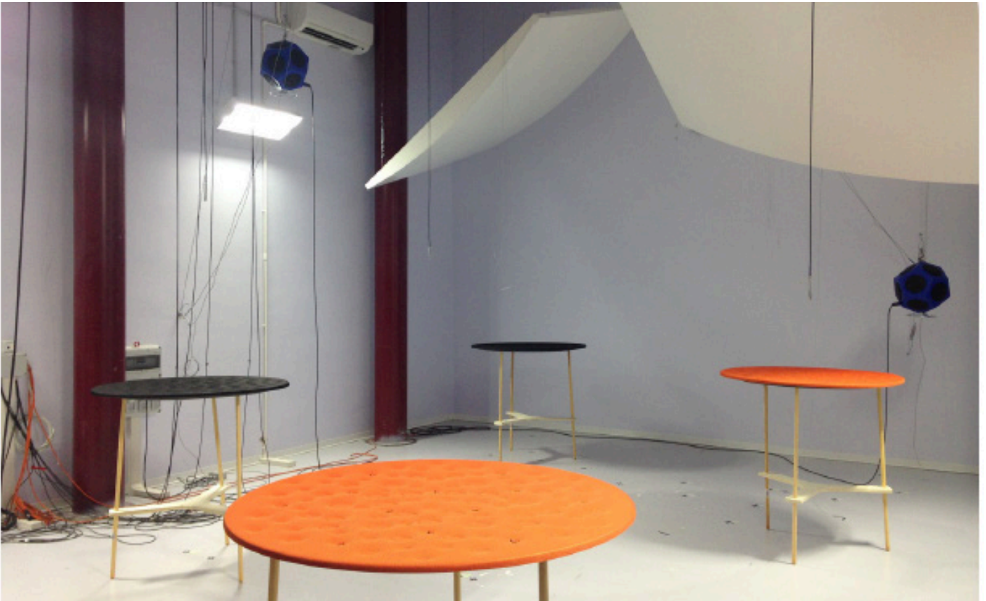
Figure 2: Arrangement of the 4 Silent Field 2.0 lamps in reverberant chamber.