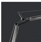
TOLOMEO TERRA SNODO A014000