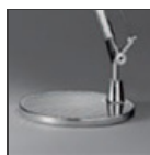
TOLOMEO BASE TV ALL D230 A004030