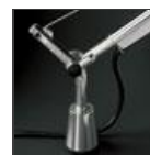
TOLOMEO SUPP.TAVOLO FISSO A004200