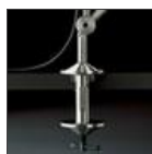
TOLOMEO MORSETTO A004100