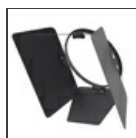
Adjustable dowsers - Vector 55 AP91500