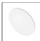
Lens for elliptical emission - Vector 55 AP91200