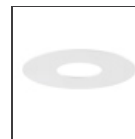
Vector 40 - Optional Trim Frame Ø 108 - White Ap59001