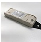
Driver 15-36W 500-700mA - 220- 24Vac - Undimmable - 146,5x43,5x22 mm (LxWxH) dv1030