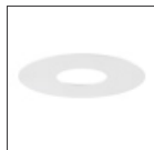
Vector 55 - Optional Trim Frame Ø 108 - Black Ap59104