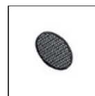
Anti-dazzle louvre M282100