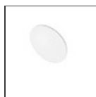
Lens for elliptical emission M282007