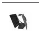
Adjustable dowsers M059910