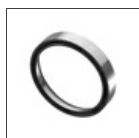
Accessories holder - Vector 95 AP92100