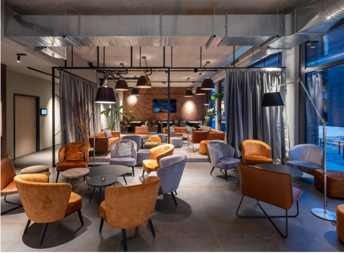
Nur - Ernesto Gismondi | Tolomeo Mega Floor - Michele De Lucchi & Giancarlo Fassina