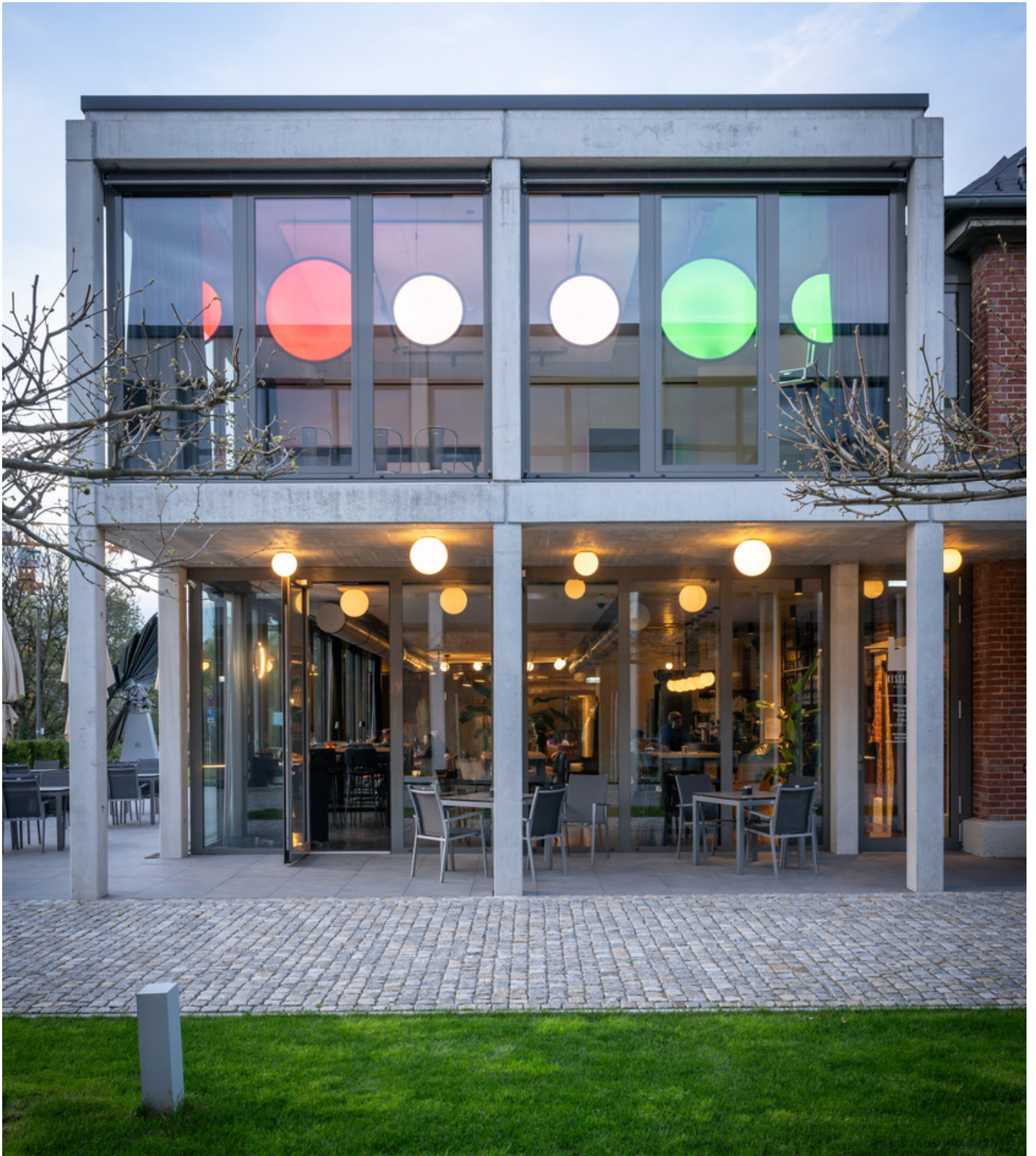
Discovery Vertical - Ernesto Gismondi | Dioscuri - Michele De Lucchi