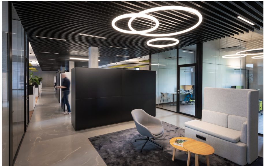
Alphabet of Light Circular - Bjarke Ingels Group

Salvia Group covers the entire technical life cycle of buildings. From planning to management and service. With more than 26 locations throughout Germany, it can realise projects of any size.