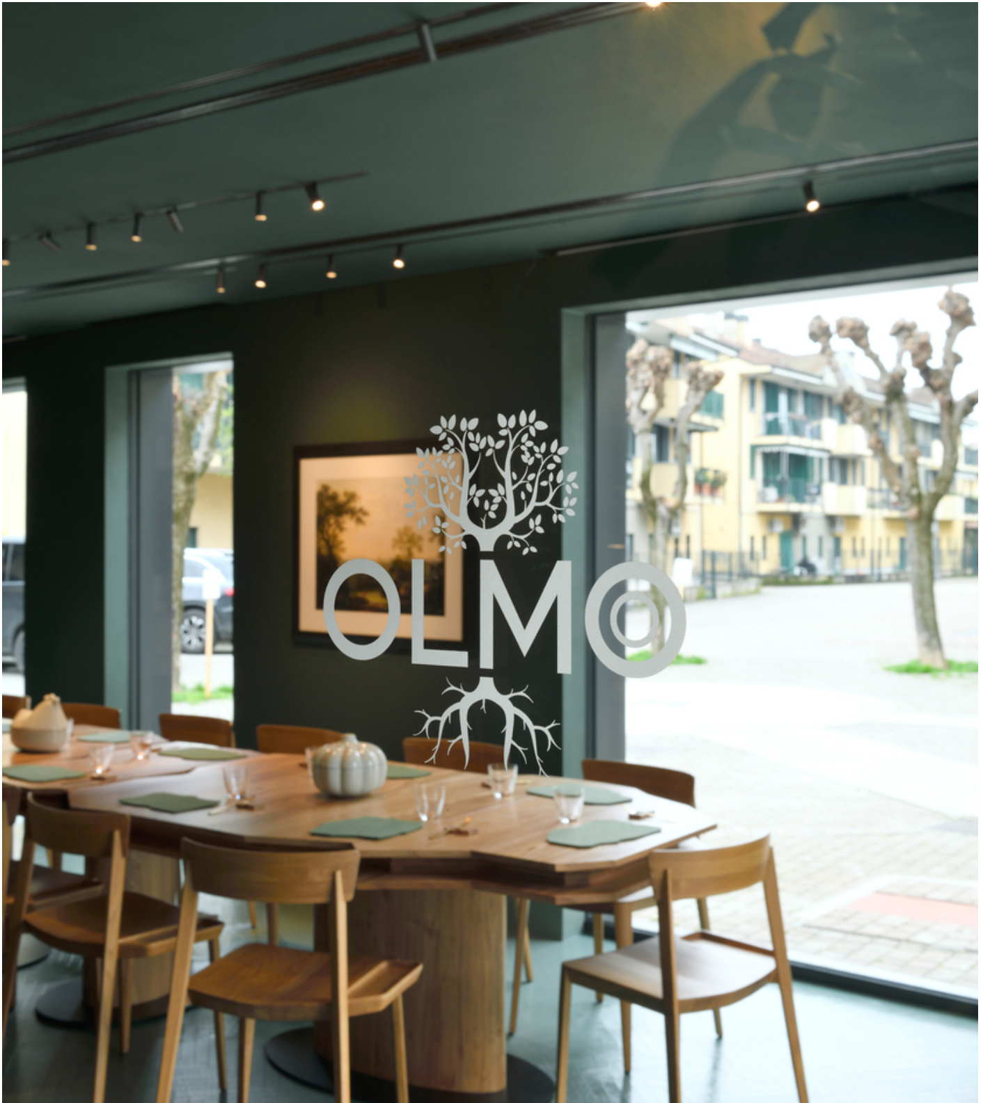
Turn Around + Vector - Carlotta de Bevilacqua

Artemide and celebrity chef Davide Oldani join forces once again to illuminate the new “ Olmo ” restaurant with a unique and long-established synergy. Located in a charming little square, the restaurant takes its name from the imposing tree that stands in the centre, deeply rooted in the ground and reaching upwards, symbolising stability and growth.