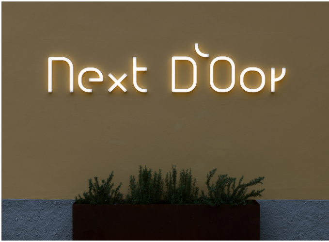
Alphabet of Light Letter Custom Outdoor - Bjarke Ingels Group