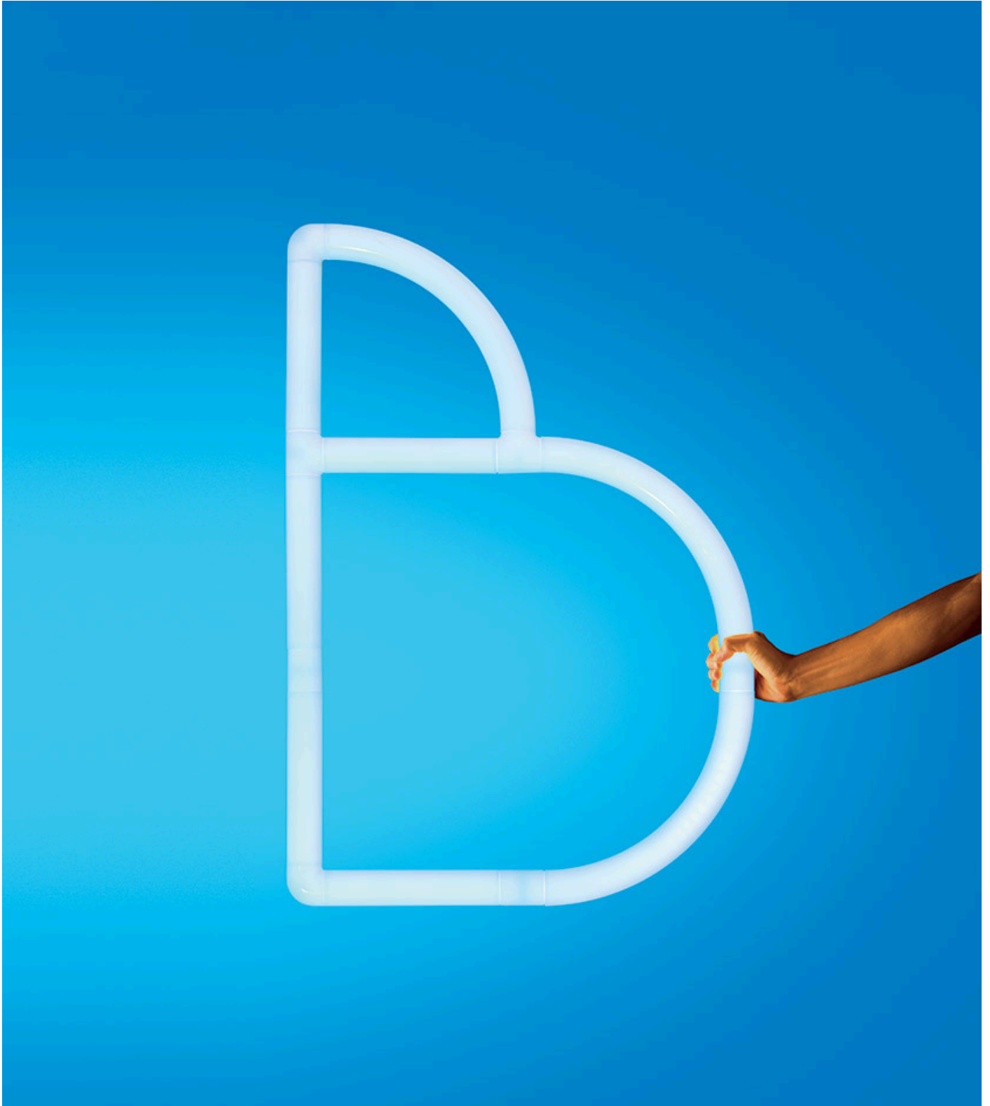
Alphabet of Light, 2016

Over the past ten years, the collaboration between BIG and Artemide has developed into a rich and dynamic dialogue between architecture, design, and innovation. United by a shared experimental approach and a strong focus on research, BIG and Artemide have brought to life numerous products that express a common vision: creating solutions that combine technical performance, formal clarity and a deep sensitivity to space and human experience. This long-standing partnership reflects a continuous exchange of ideas, resulting in a remarkable body of work that embodies the identity and values of both brands.