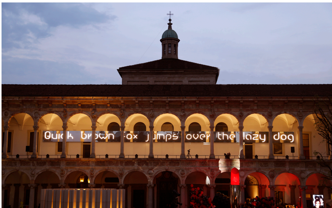
Alphabet of Light

INTERNI Material Immaterial, Università degli Studi di Milano, Italy, 2017