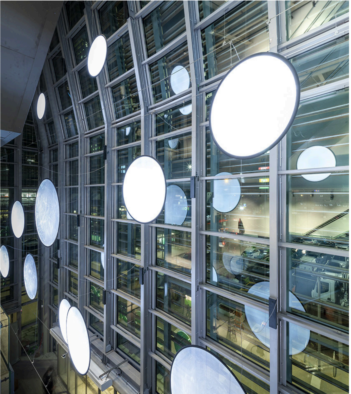
Discovery Vertical - Ernesto Gismondi

A cluster of 28 Discovery lamps, specially made in the custom size of 190cm, welcomes the visitor in the full-height space that connects the five floors. The transparent surface comes to life with a white or coloured light, green in honour of Green Pea, for a spectacular solution, which can also be glimpsed from the outside through the façade.