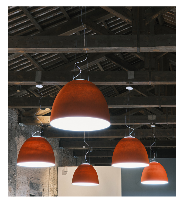
Nur Acoustic by Ernesto Gismondi

INTEGRALIS® technology is also active in Educational spaces with Nur Acoustic, which combines light, sound absorption and sanitisation to ensure total environmental quality.