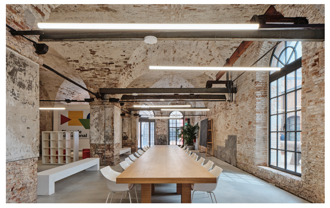
Alphabet of Light by BIG in the Educational room