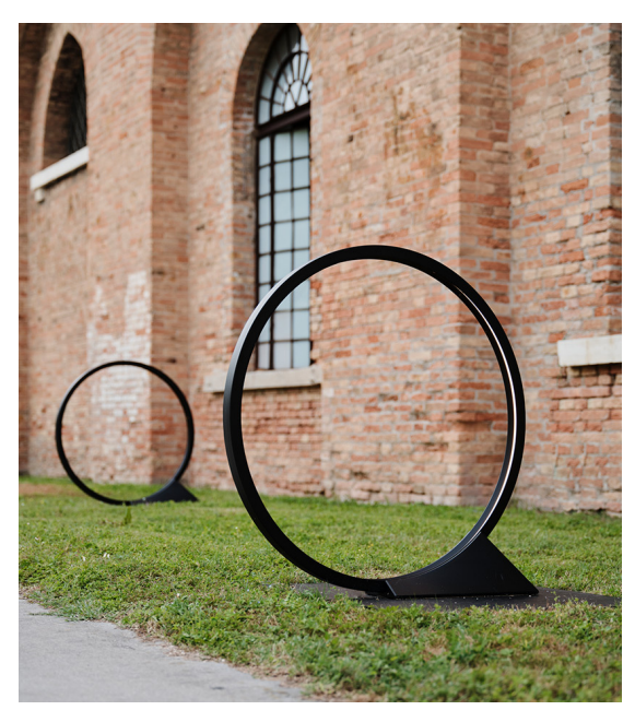
"O" by Elemental

La Biennale di Venezia brings back ethical content and social research. "How will we live together?" invites us to reflect on the spaces of living together generously, according to new associative geographies to address the current crises with inclusion and spatial identity.