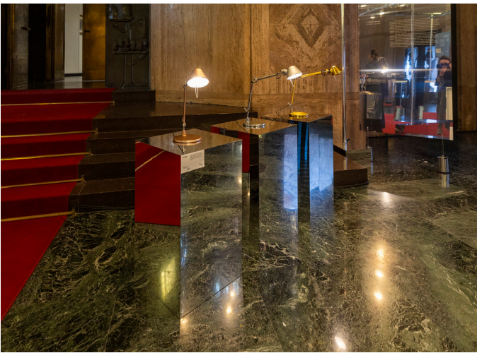
Tolomeo Micro Table - Michele De Lucchi & Giancarlo Fassina

Through two distinct narrative paths, visitors were able to immerse themselves in the fascination of our manufacturing: on the one side, admiring the forms and functionality of our design products, and on the other, exploring the secrets of our production through engaging immersive videos.