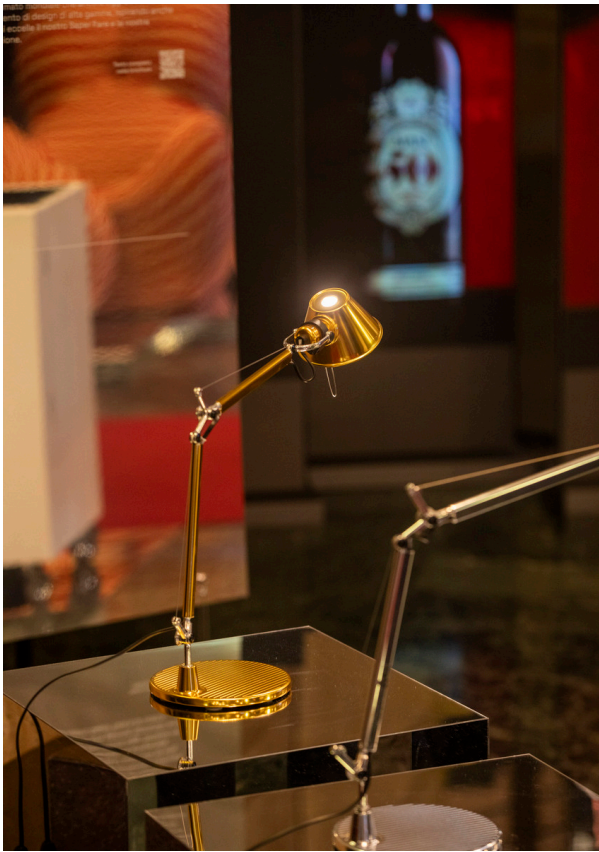
Tolomeo Micro Table - Michele De Lucchi & Giancarlo Fassina