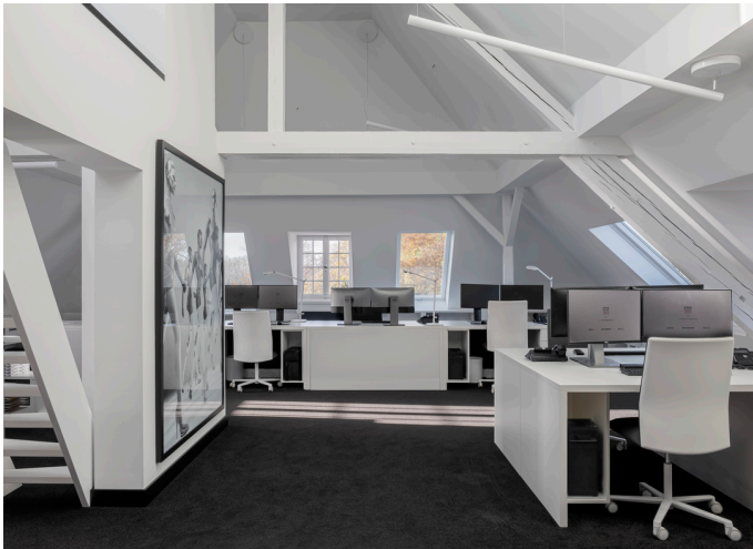
Alphabet of Light Linear - Bjarke Ingels Group | Demetra - Naoto Fukasawa