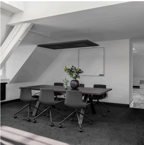
Eggboard Matrix - Progetto CMR