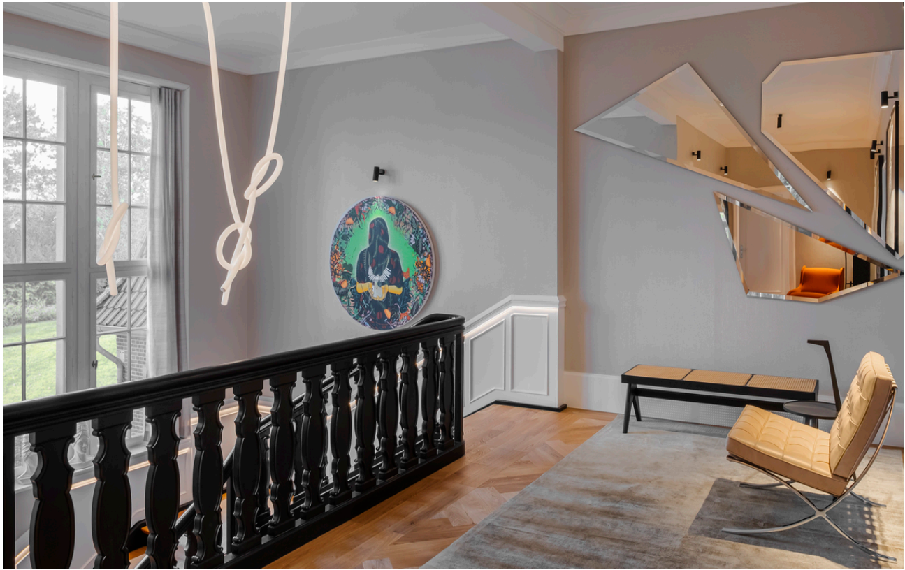
La Linea - Bjarke Ingels Group