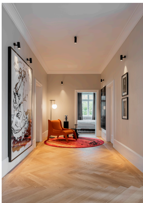
nh Floor - Neri & Hu | Vector Ceiling - Carlotta de Bevilacqua