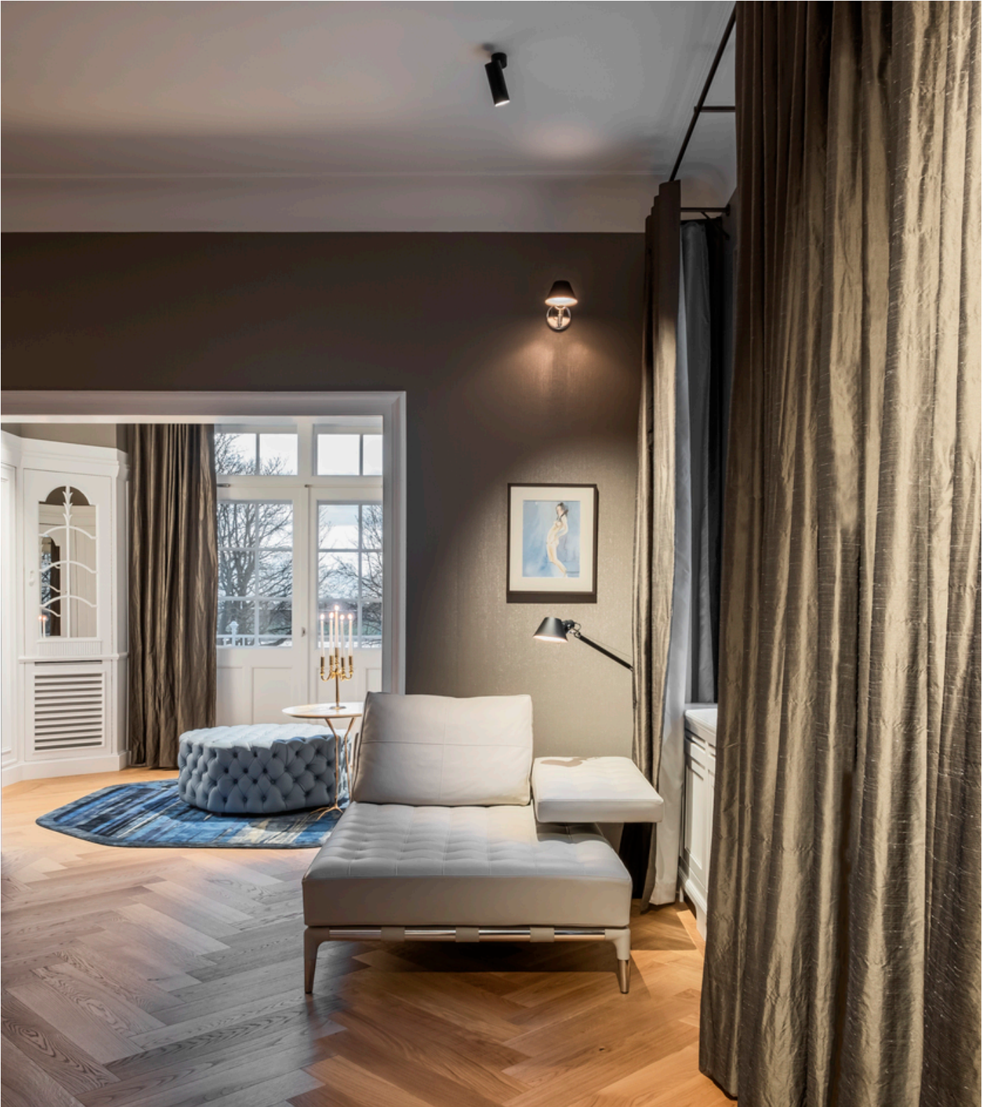
Tolomeo & Tolomeo Faretto - Michele De Lucchi