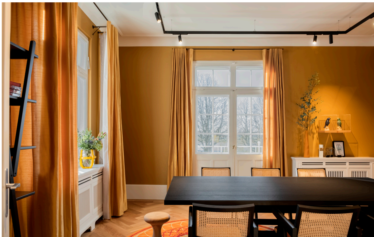
Vector Track - Carlotta de Bevilacqua