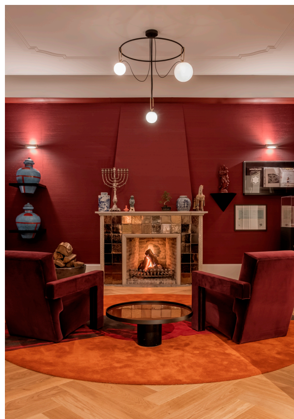
nh S4 Circulaire - Neri & Hu