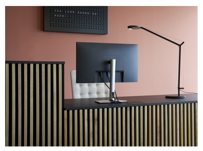
Demetra Professional Table - Naoto Fukasawa