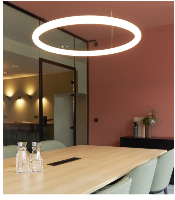
Alphabet of Light Circular - BIG Bjarke Ingels Group