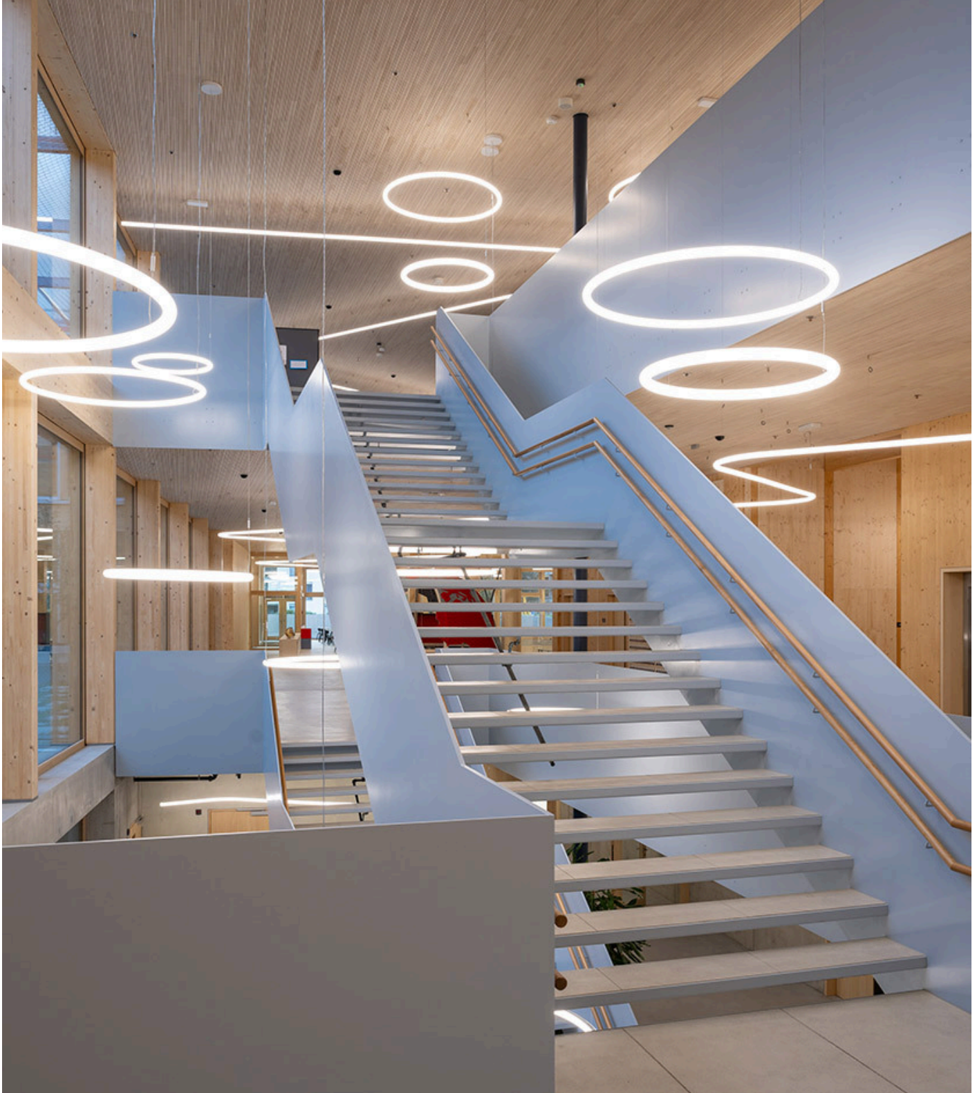
Alphabet of Light - Bjarke Ingels Group

Sustainability is consistently implemented in the pure timber construction made of regional spruce wood, from the photovoltaic system to the energy-efficient lighting and the intensive green roof.