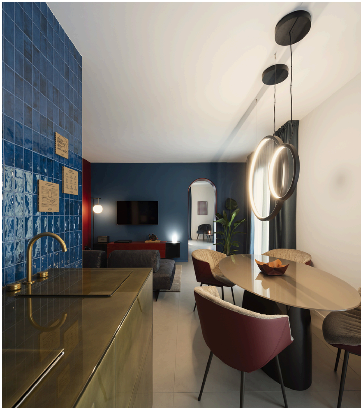
"O" suspension - Elemental