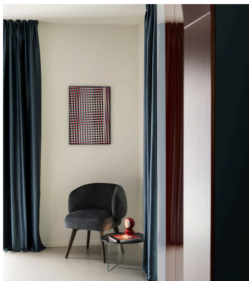
Eclisse - Vico Magistretti