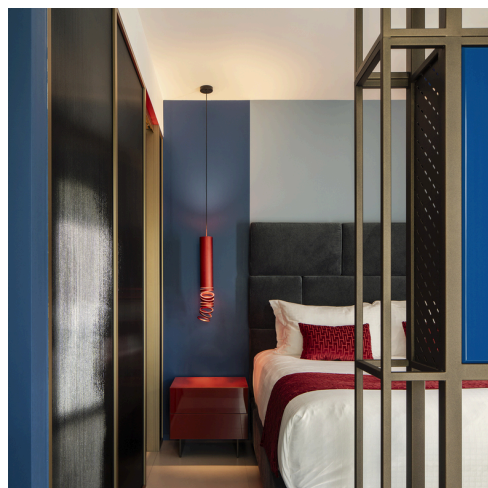
Decomposé Light Suspension - atelier oï