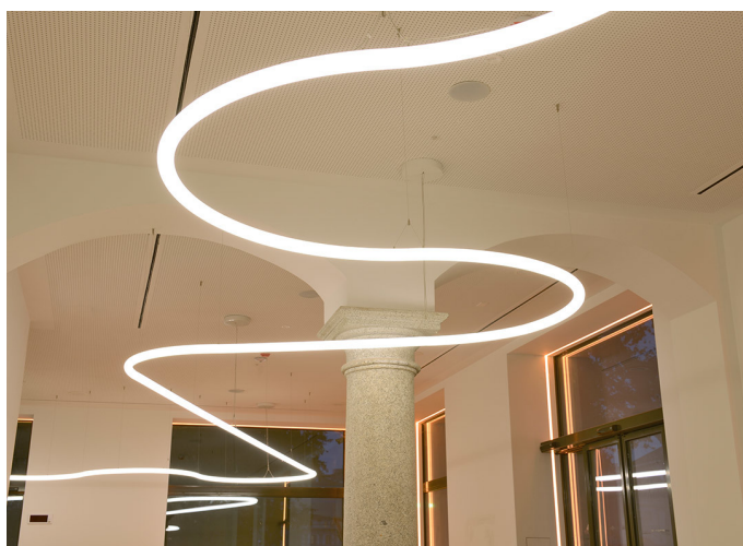
Alphabet of Light System - BIG

➤ The light of Artemide describes and highlights the architecture