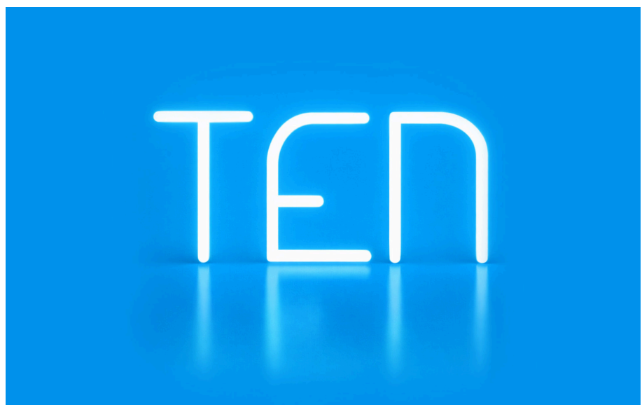
Alphabet of Light Letters Mini - BIG Bjarke Ingels Group

Milan Design Week also provides an opportunity to celebrate ten years of collaboration between Artemide and BIG – Bjarke Ingels Group : a shared journey of research and experimentation, in which light enters into dialogue with architecture, becoming an integral part of the design language. A relationship built over time through a common vision, translated into contemporary solutions capable of redefining the dialogue between light and space.