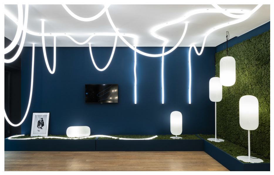
La Linea and Gople Outdoor by BIG

Artemide increasingly explicitly declares its perspective towards the future: an approach to design guided by values, driven not only by scientific research and technological and production expertise but also by a humanistic and ethical approach.