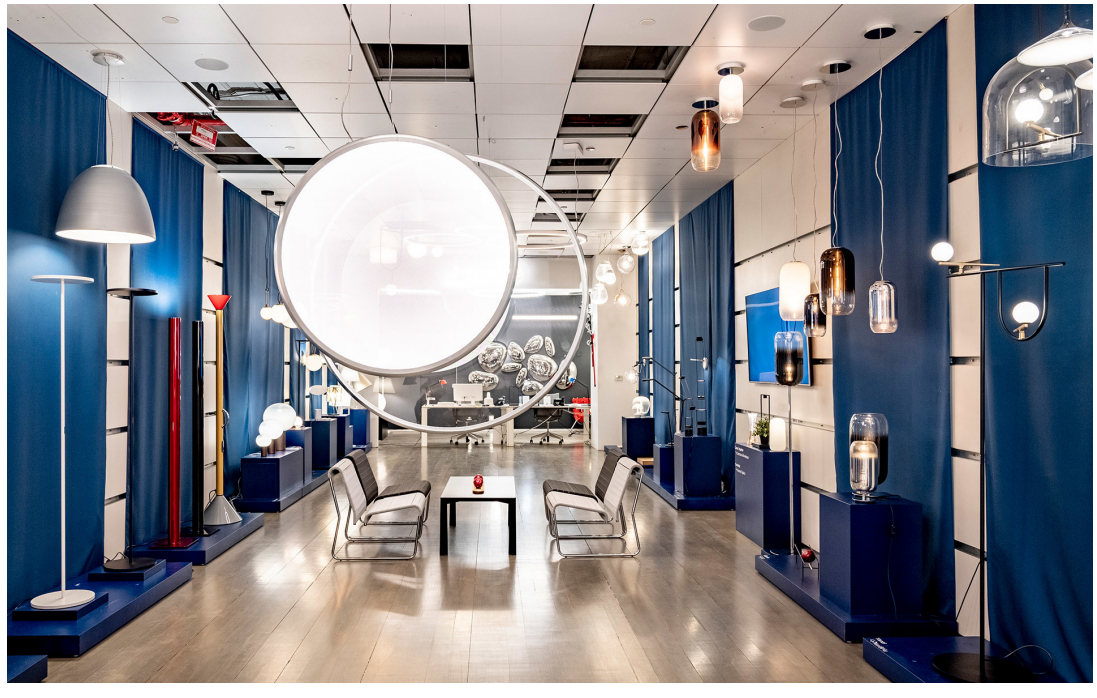
Some pictures from the events