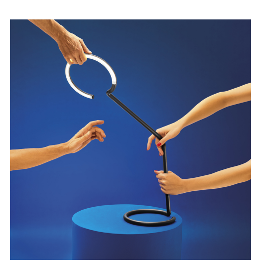
Vine Light - BIG Bjarke Ingels Group