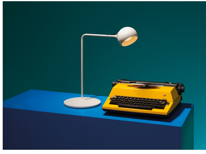
Ixa - Foster + Partners