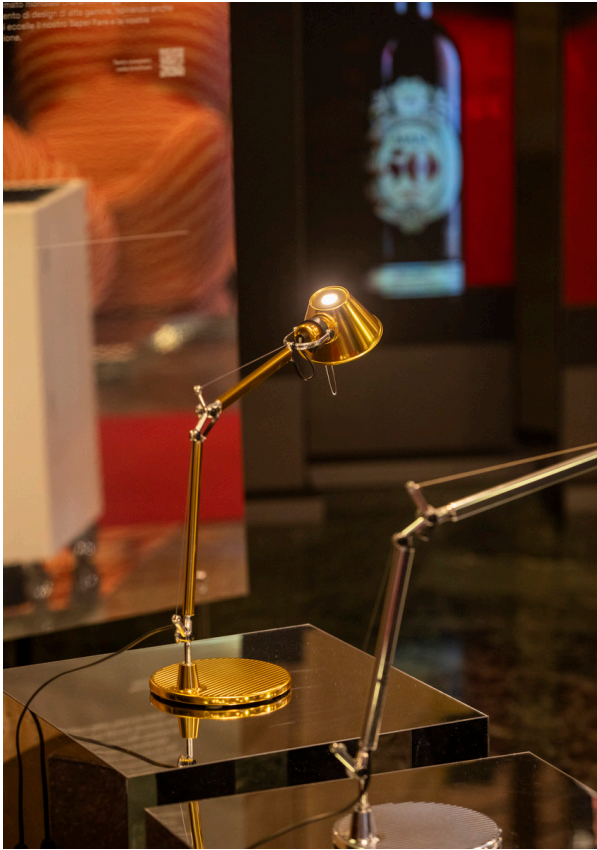
Tolomeo Micro Table - Michele De Lucchi & Giancarlo Fassina