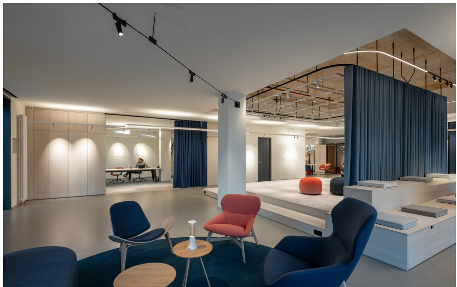
Funivia & Come Together - Carlotta de Bevilacqua