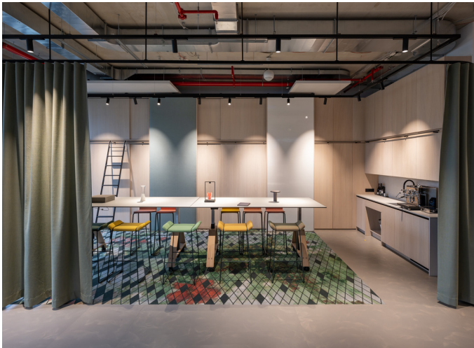
Vector Track - Carlotta de Bevilacqua