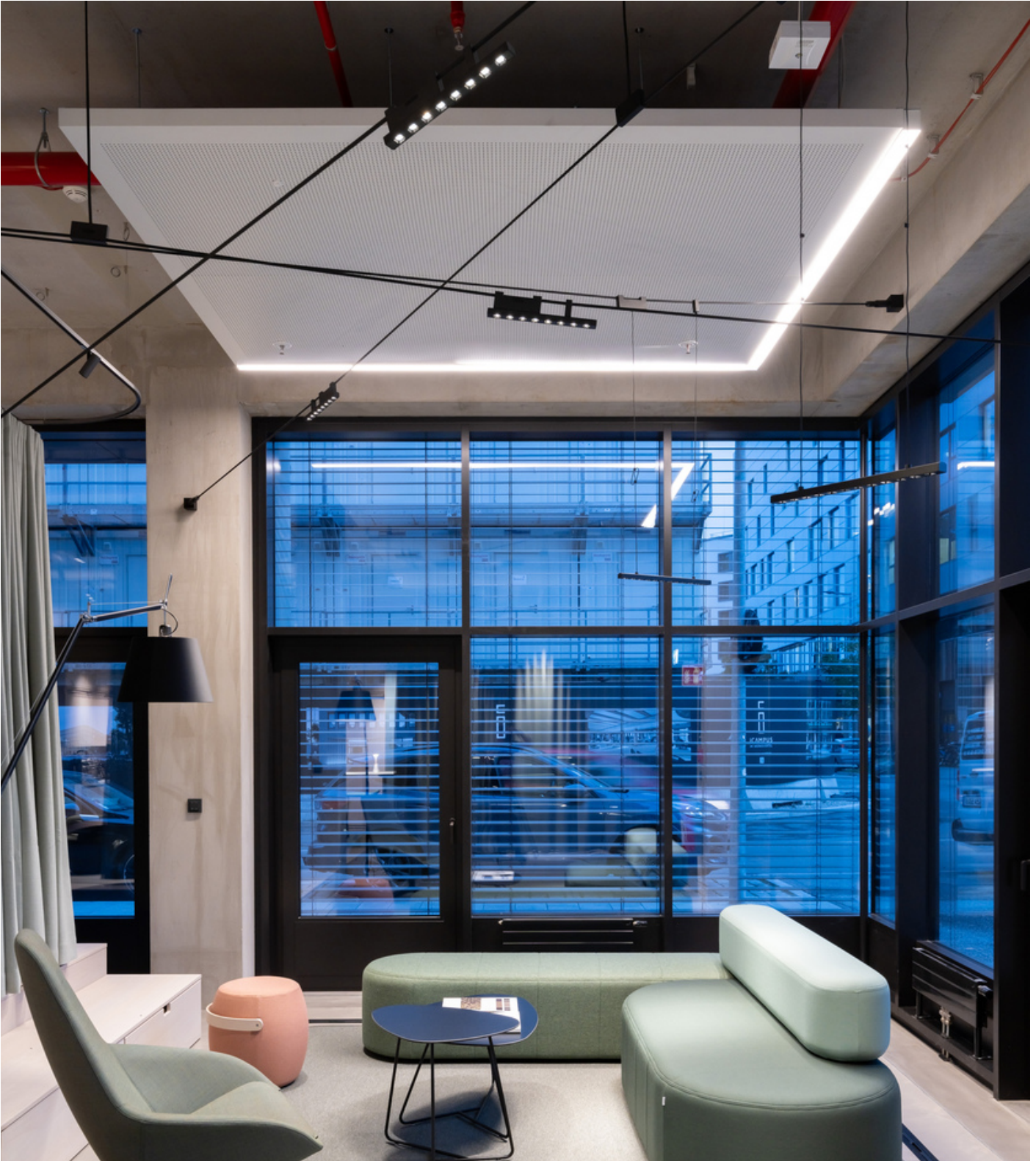
Funivia - Carlotta de Bevilacqua

We are pleased to present IDX - Your Stage , a collaborative project bringing together Artemide , Ege Carpets and Gabriel . These premium brands redefine the approach to customer loyalty, creating spaces for meeting and networking across traditional boundaries. With a shared vision of creativity, sustainability and stimulation, IDX offers a platform dedicated to meeting and sharing ideas on design and architecture. "Your Stage" goes beyond a slogan, providing a stage for meetings, events and exhibitions, offering an immersive experience.