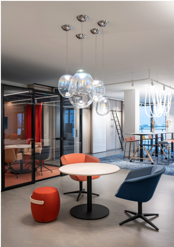
Stellar Nebula - BIG Bjarke Ingels Group