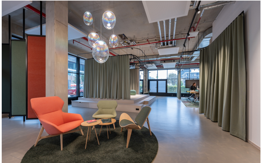
Stellar Nebula - BIG Bjarke Ingels Group