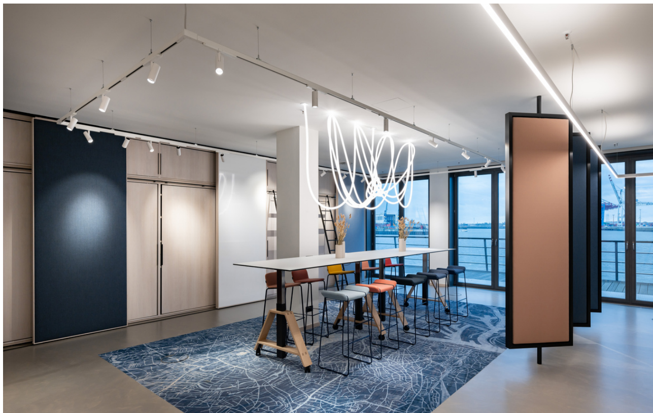
La Linea - BIG Bjarke Ingels Group