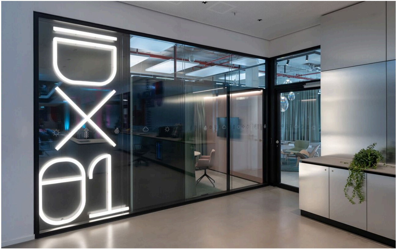
Alphabet of Light - BIG Bjarke Ingels Group