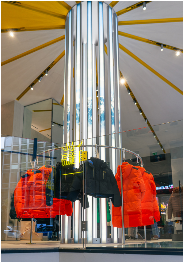
Vector Track 55 - Carlotta de Bevilacqua