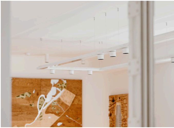
Hoy System - Foster + Partners Industrial Design