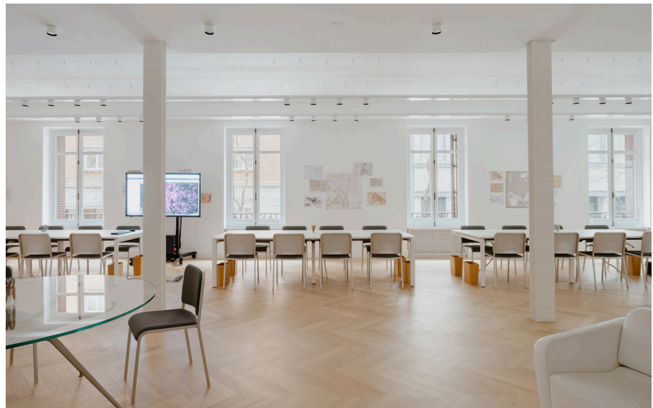
Hoy Spot & Hoy System - Foster + Partners Industrial Design