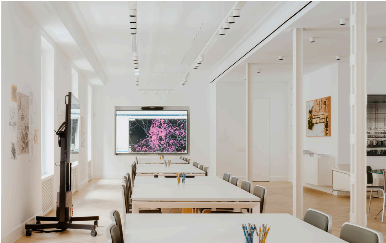
Hoy Spot & Hoy System - Foster + Partners Industrial Design

Within this context of excellence, a lighting project was developed to highlight the headquarters, creating functional and welcoming environments. The Hoy family, the result of a collaboration between Artemide and Foster + Partners Industrial Design , harmonizes light and architecture, emphasizing both exhibition areas and zones dedicated to education and research. A project that combines design and functionality, demonstrating how thoughtful use of light can support creativity, research, and innovation, while enhancing the everyday experience within the foundation.