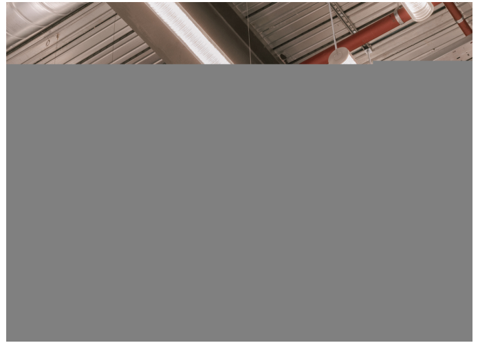
Criosfera - Giulia Foscari UNA / UNLESS

The lighting design supports the reading of materials and products, integrating ambient and accent light to highlight displays and key areas. Particular attention is given to the fitting rooms and the adjacent waiting area, conceived as intimate and comfortable spaces. Here, Alphabet of Light Linear and Dioscuri introduce a softer and more diffused light, enhancing the perception of materials and creating a relaxed, domestic atmosphere that contrasts with the more dynamic retail area.