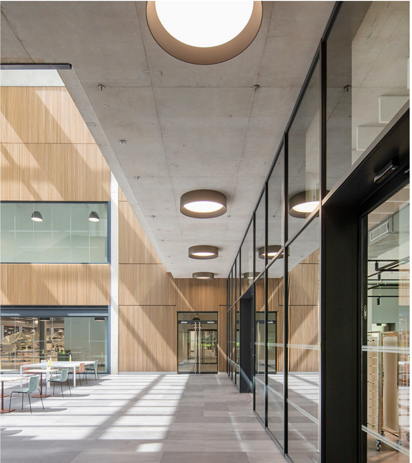
Tagora 970 Ceiling