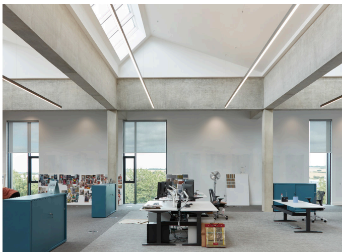
A.39 Diffused - Carlotta de Bevilacqua