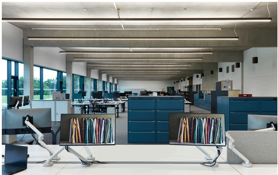
A.39 Diffused - Carlotta de Bevilacqua