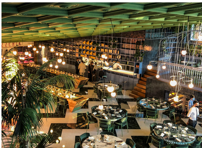
nh - Neri&Hu