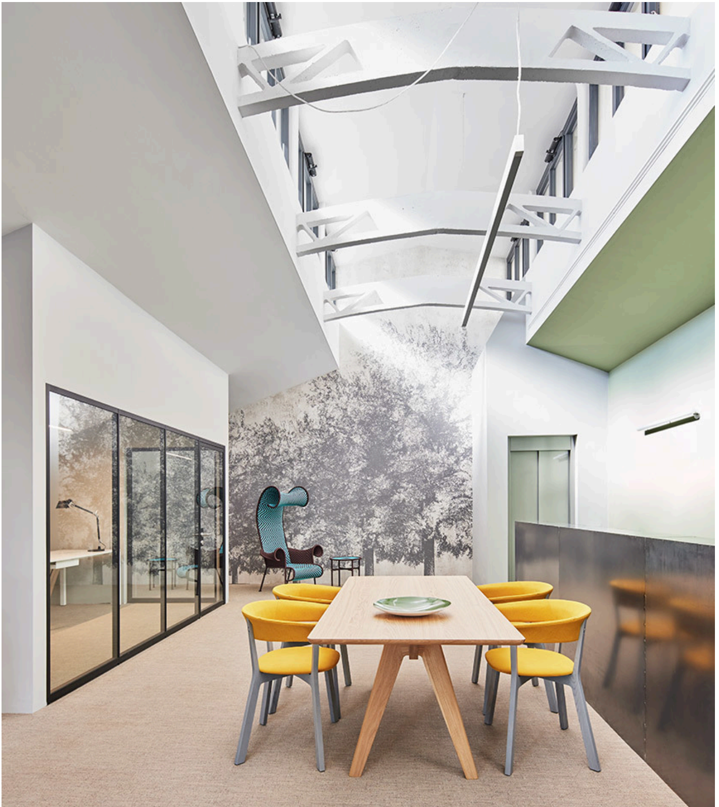
A.39 Diffused - Carlotta de Bevilacqua

The project of the new national headquarters of the AIS (Associazione Italiana Sommelier) involved the renovation and redevelopment of two existing buildings. Behind the project there was a change of perspective based on latest-generation spaces and equipment, with an eye to sustainability, one of the pillars of the project from the beginning.