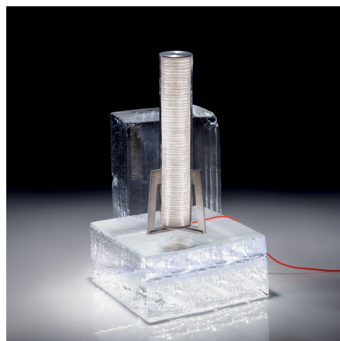
Criosfera - Giulia Foscari UNA/UNLESS