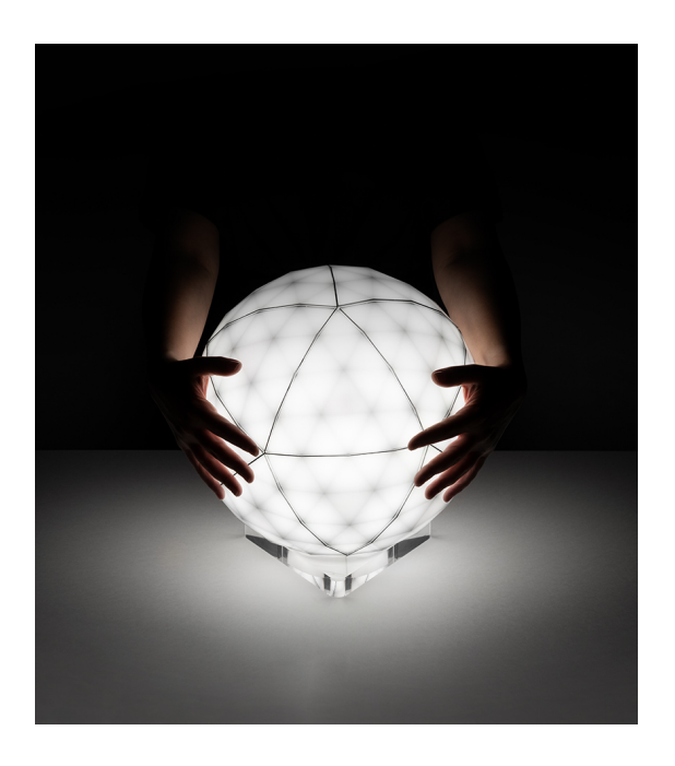
Huara is both analogical and digital. It creates a simple and direct relationship with humankind that, with a simple touch, can model different light scenarios, thanks to its triangular sectors that react separately.