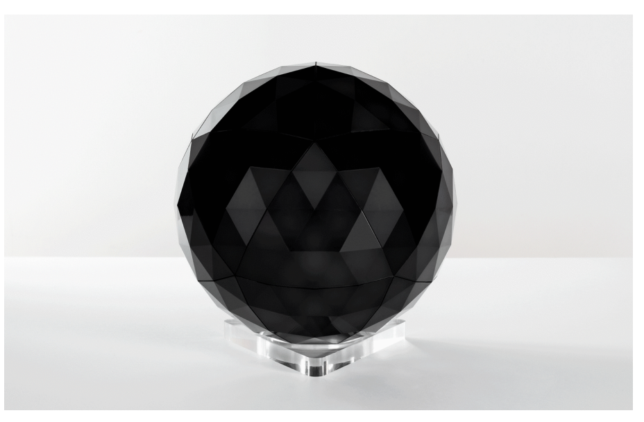
With a simple touch, can model different light scenarios