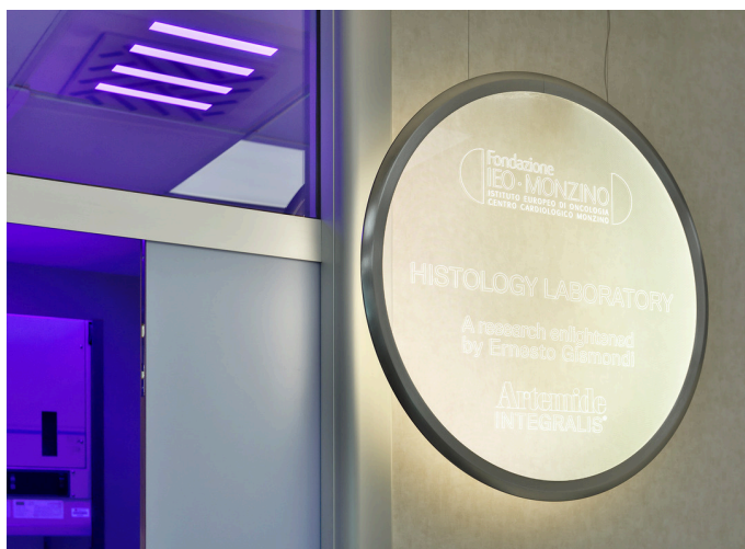
Discovery Special - Ernesto Gismondi | A.39 Diffused Pure Integralis - Carlotta de Bevilacqua

Two laboratories, the Microscopy laboratory and the Histology laboratory, have been illuminated, with a focus on environmental conditions through the reduction, thanks to light, of pathogenic microorganisms.