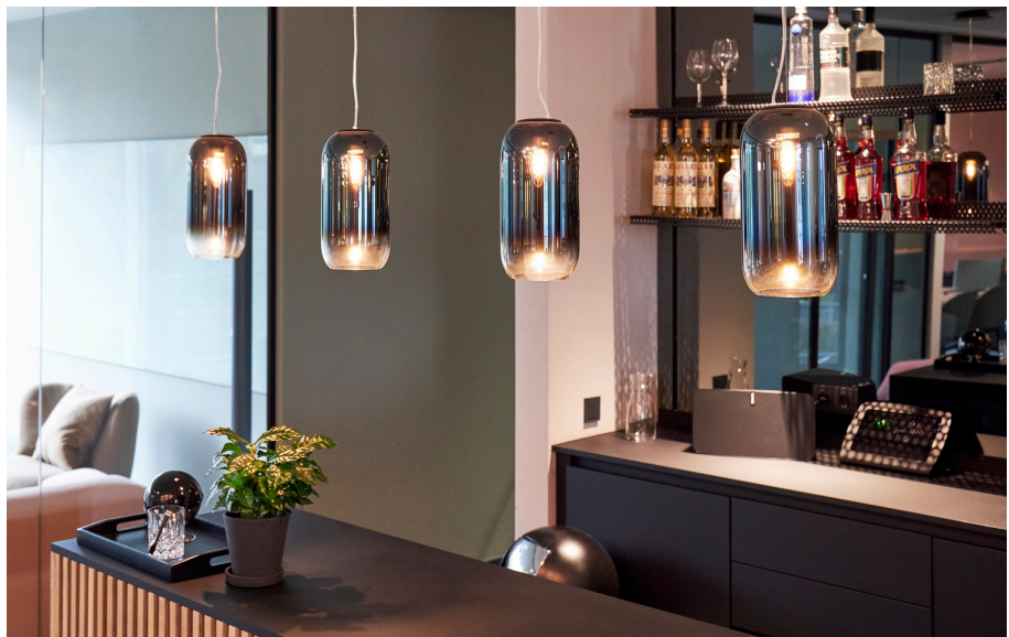
Gople Suspension - BIG Bjarke Ingels Group