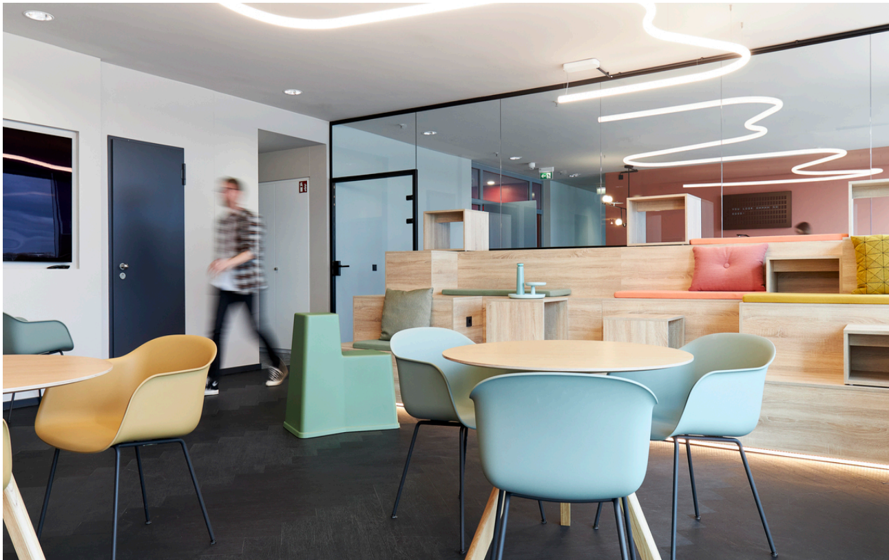
Alphabet of Light System - BIG Bjarke Ingels Group