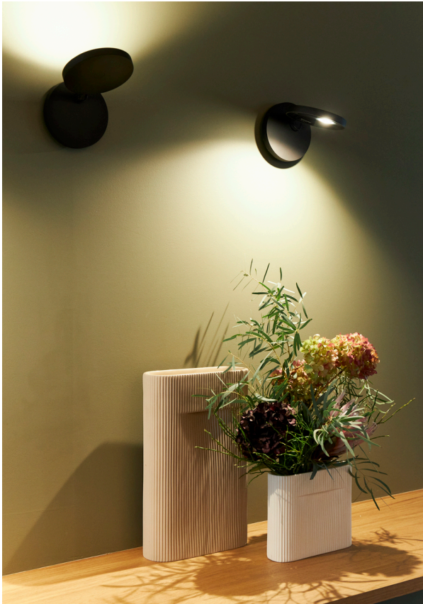
Demetra Wall - Naoto Fukasawa