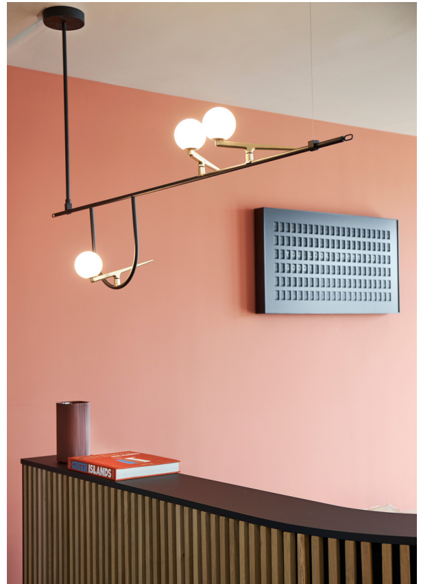
Yanzi Suspension 1 - Neri&Hu