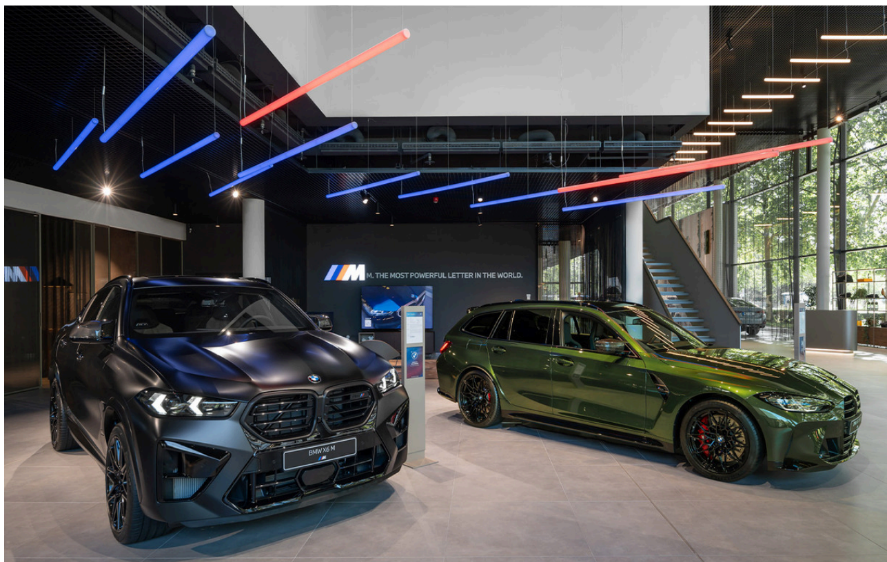
AoL Linear Special RGB - BIG Bjarke Ingels Group