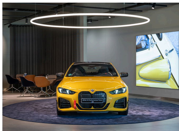
AoL Suspension Circular - BIG Bjarke Ingels Group