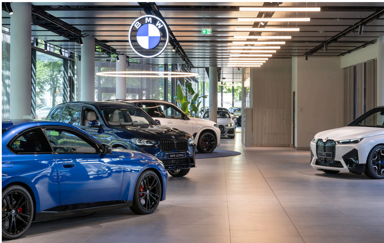
AoL Linear | Circular - BIG Bjarke Ingels Group