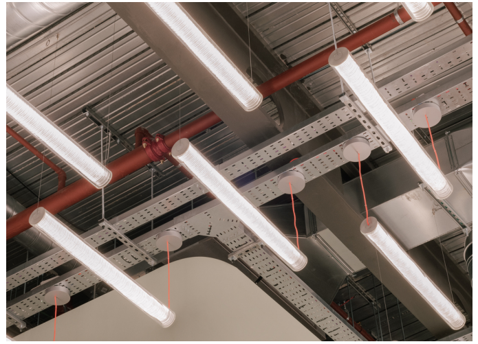
Criosfera - Giulia Foscari UNA / UNLESS

The lighting design supports the reading of materials and products, integrating ambient and accent light to highlight displays and key areas. Particular attention is given to the fitting rooms and the adjacent waiting area, conceived as intimate and comfortable spaces. Here, Alphabet of Light Linear and Dioscuri introduce a softer and more diffused light, enhancing the perception of materials and creating a relaxed, domestic atmosphere that contrasts with the more dynamic retail area.