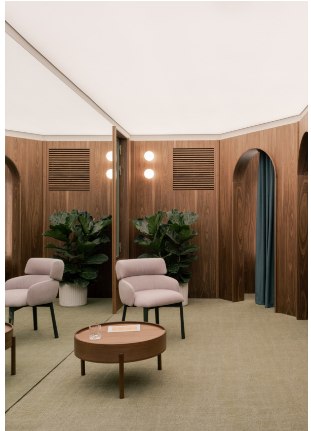
Dioscuri - Michele De Lucchi

A project where different lighting solutions integrate with the architecture, with Criosfera defining a contemporary and balanced atmosphere aligned with the Luca Faloni brand.