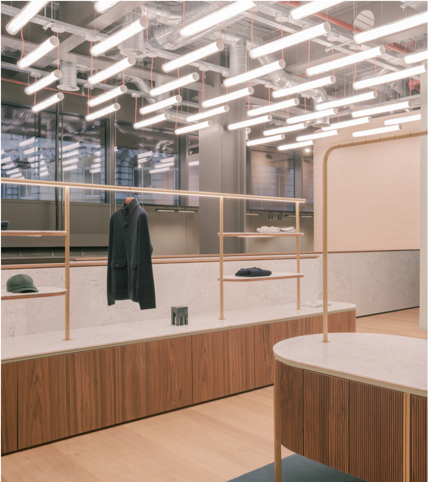
Criosfera - Giulia Foscari UNA / UNLESS

Artemide contributes to the new Luca Faloni store with a lighting project that enhances the architectural language and defines a refined and welcoming retail experience. The space combines warm materials such as wood and stone with a more technical, open ceiling, where light becomes a distinctive element. Here, Criosfera structures the perception of the environment through a rhythmic composition of suspended luminaires, creating a luminous landscape that adds depth and identity while providing soft and uniform illumination.