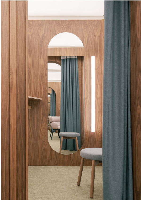
Alphabet of Light Linear - Bjarke Ingels Group