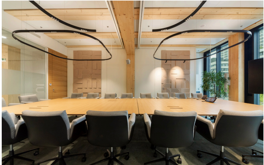
A.24 System - Carlotta de Bevilacqua

The numerous Artemide solutions create different layers of light: from the functional illumination of A.24 for the operational areas to the scenic accents of Alphabet of Light and Gople System for shared spaces. The result is a coherent and flexible intervention, designed to meet the needs of contemporary work , support visual comfort throughout the day and make visible a new balance between technology, nature and well-being .