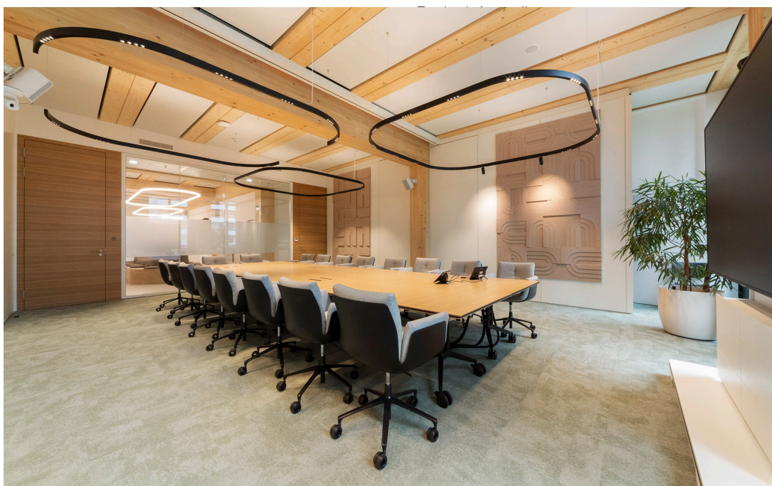
A.24 System - Carlotta de Bevilacqua