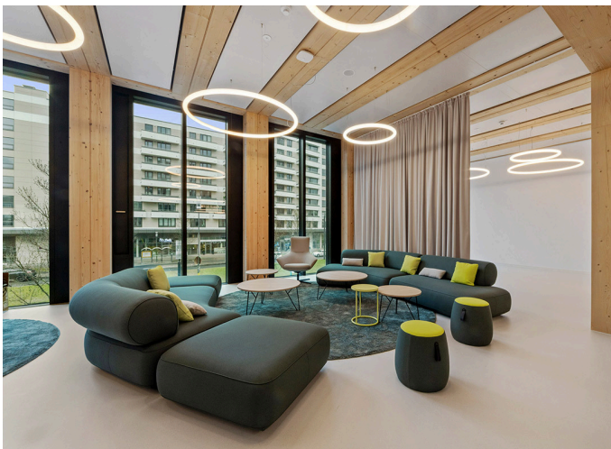
Alphabet of Light Circular - BIG Bjarke Ingels Group