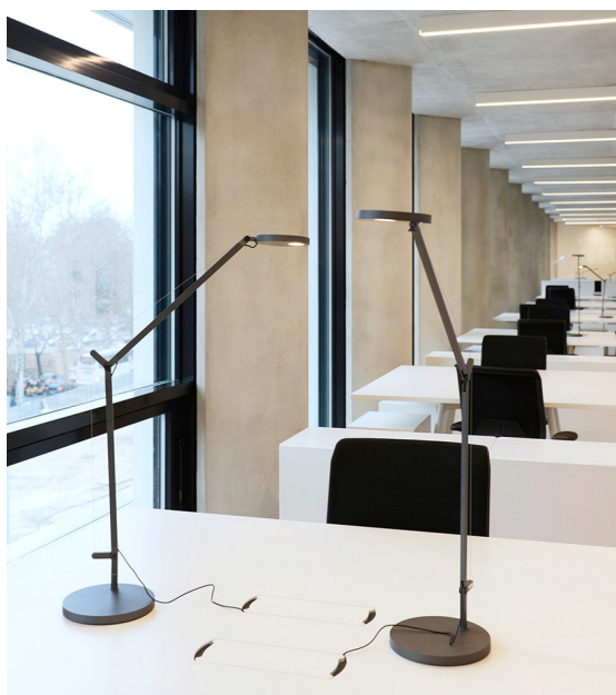
Demetra - Naoto Fukasawa

In the third and fourth floor office environments, the Algoritmo system, integrating with the architecture, defines a uniform illuminance perfect for workspaces where each workstation is also supported by Demetra task light table.