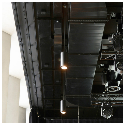
Special version of Ourea