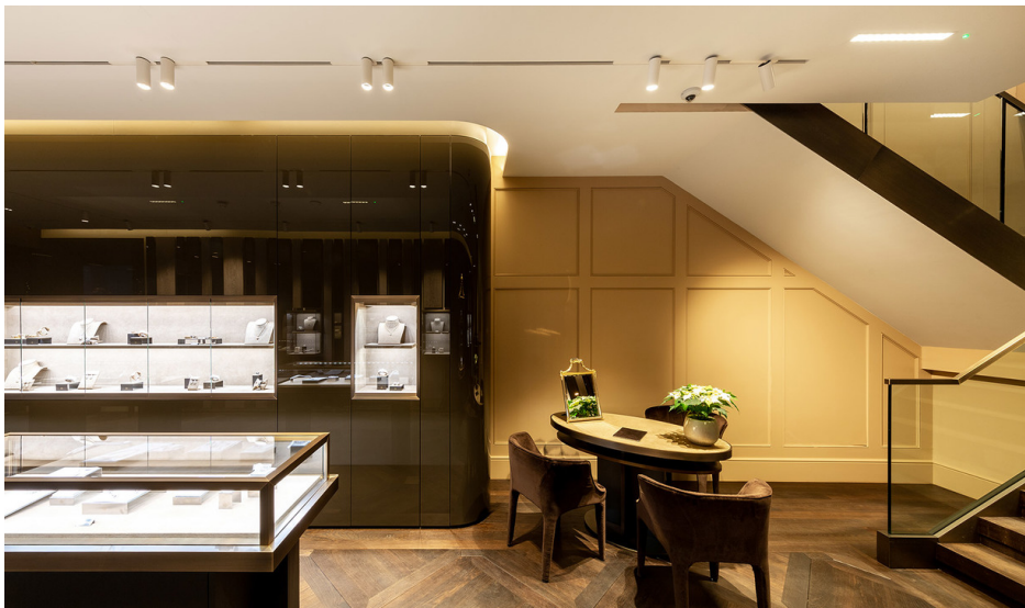
A.24 System + Vector Magnetic | Sharp Recessed - Carlotta de Bevilacqua

➤ Año / 2020 Categoría / Retail Autor / Studio Quadrilatero + Ink Associates