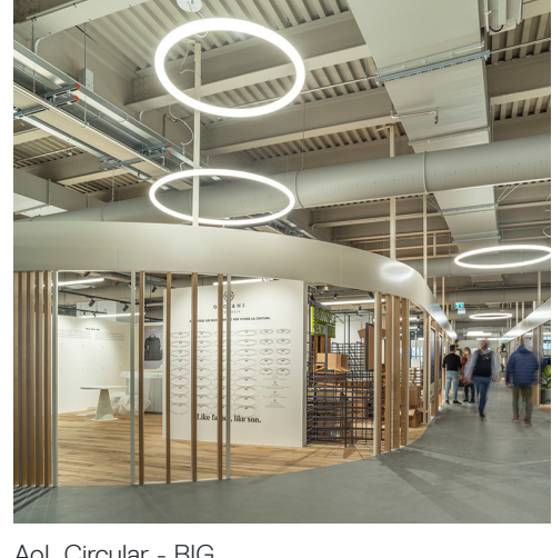
AoL Circular - BIG