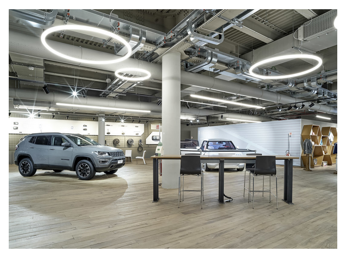
AoL Circular, AoL Linear - BIG

The whole Artemide collection is an expression of a responsible, informed approach to design. Artemide is committed to ongoing research in order to develop lighting systems that pursue the goal of maximum energy efficiency. Focus is on the materials and production processes but the sustainable approach does not end in the product: over time it generates a positive impact on the energy balance of the spaces it illuminates.