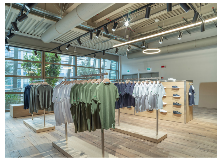
AoL - BIG | Vector Track - Carlotta de Bevilacqua