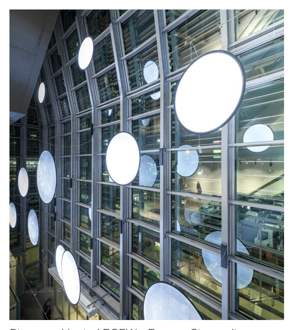
Discovery Vertical RGBW - Ernesto Gismondi

A cluster of 28 Discovery lamps, specially made in the custom size of 190cm, welcomes the visitor in the fullheight space that connects the five floors. The transparent surface comes to life with a white or coloured light, green in honour of Green Pea, for a spectacular solution, which can also be glimpsed from the outside through the façade.