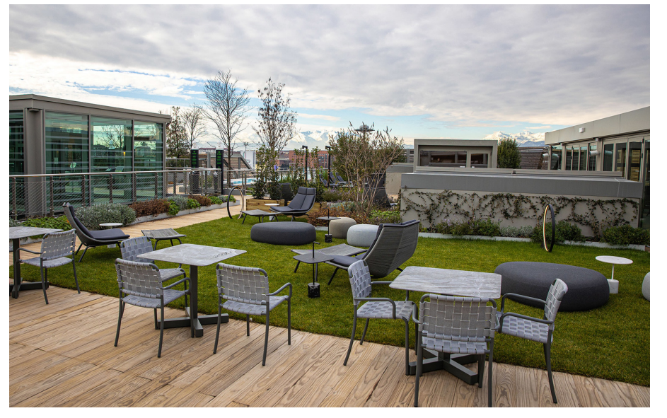
"O" - Elemental

A cluster of 28 Discovery lamps, specially made in the custom size of 190cm, welcomes the visitor in the fullheight space that connects the five floors. The transparent surface comes to life with a white or coloured light, green in honour of Green Pea, for a spectacular solution, which can also be glimpsed from the outside through the façade.