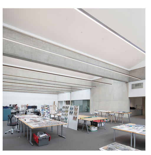
A.39 Diffused - Carlotta de Bevilacqua