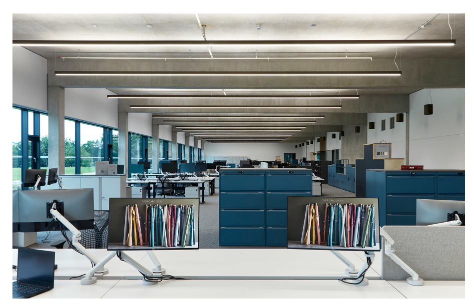
A.39 Diffused - Carlotta de Bevilacqua

Aesthetically, the concept achieves a blurring of the boundaries between the faculties of the business, something which the client was keen to achieve. Products that are typically monochrome and flat were given brushed texture and warm finishes normally found with the home. Atomic and Artemide worked to achieve a lighting scheme which does not determine any commodity areas. This was achieved by selecting only primary shapes, formats and a concise pallet of materials that would run throughout the building.