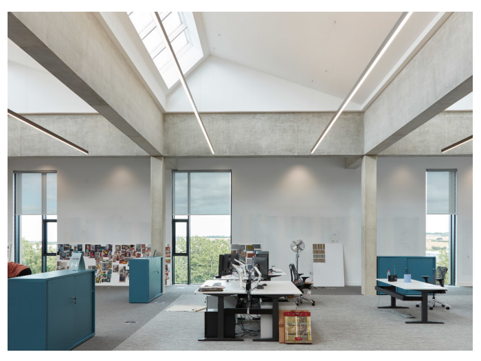
A.39 Diffused - Carlotta de Bevilacqua