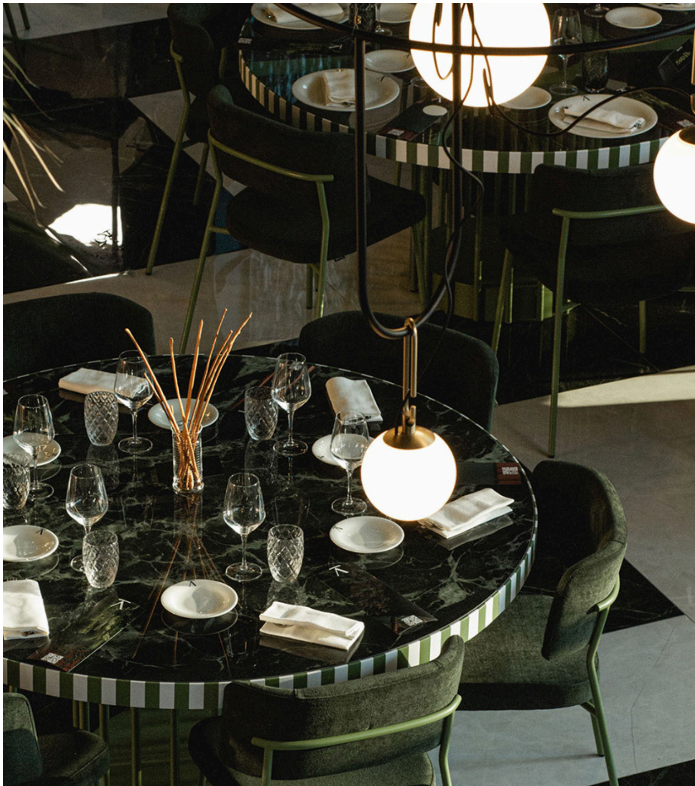
nh S4 Circaire - Neri&Hu