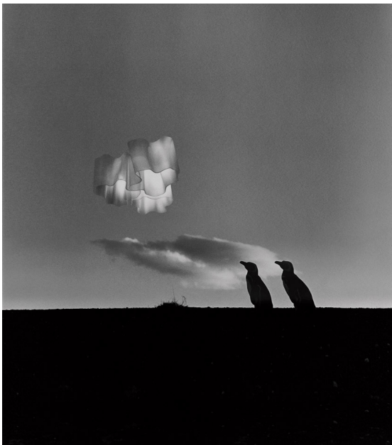
Logico

➤ Artemide's tangible commitment to 360° sustainability, not only environmental but also ethical, is a direction that has earned the company ISO 9001, ISO 14001 and ISO 45001 certifications.