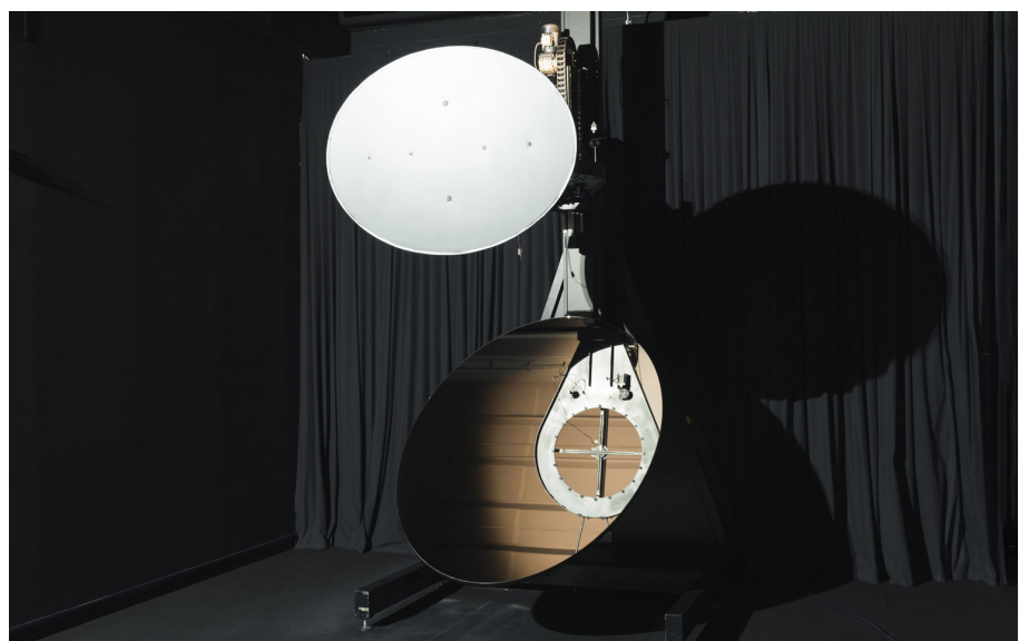
Mirror Photogoniometer, Artemide Research and Development Department