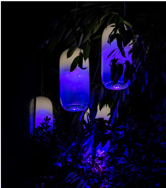
Growing Light - Gople RWB

Thanks to scientific and technological innovation, Artemide's The Human and Responsible Light philosophy makes it possible to rethink the environment, its resources and the energy project in ecosystem terms for a better quality of life.