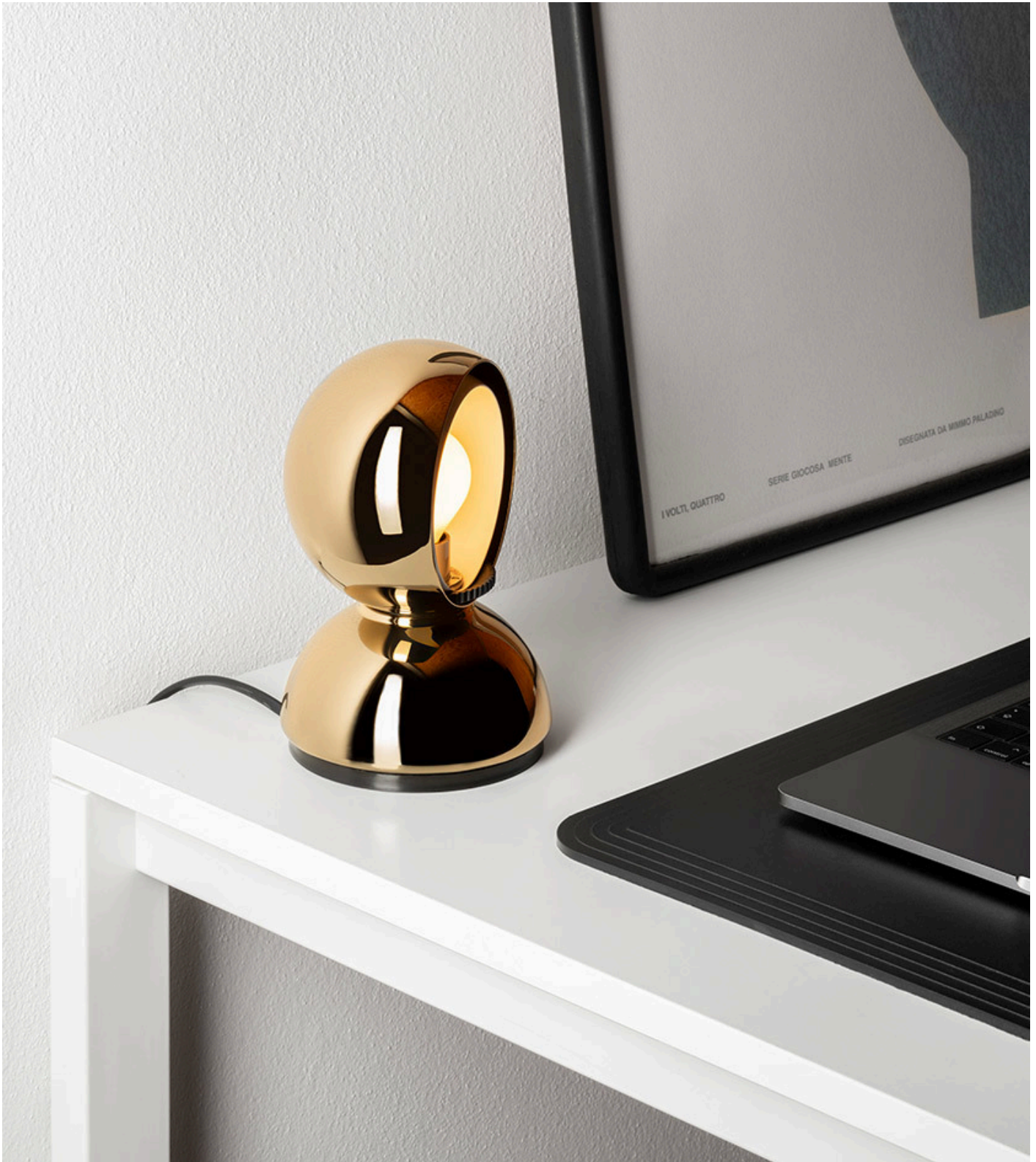
Eclisse PVD Brass - Vico Magistretti

The PVD versions of Eclisse are a perfect example of how Artemide's research into materials, finishes and processes is strongly oriented towards sustainable solutions. In the design choice, the environmental impact is a discriminating factor that imposes itself on the final aesthetic result.