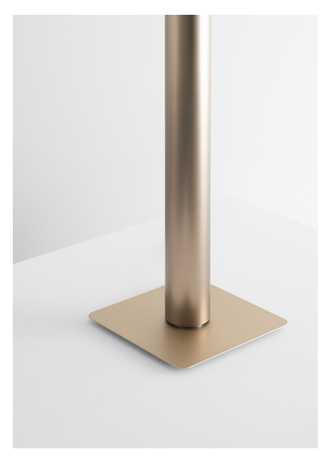
Ilio 10 Special Edition - Ernesto Gismondi

The finish obtained with the PVD (Phisical Vapour Deposition) process of this special edition of Ilio is the evidence of Artemide's focus on the environment for increasingly sustainable design and production. Dynamic light management with Artemide App makes each author aware of his/her own light.