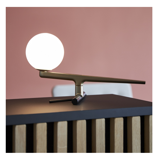
Yanzi Table - Neri&Hu Yanzi Suspension 1 - Neri&Hu