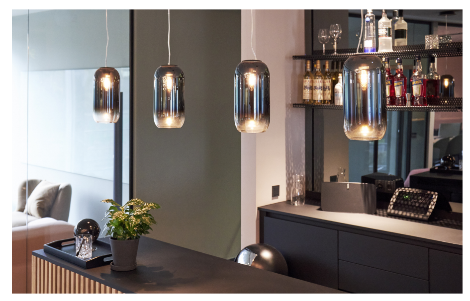
Gople Suspension - BIG Bjarke Ingels Group