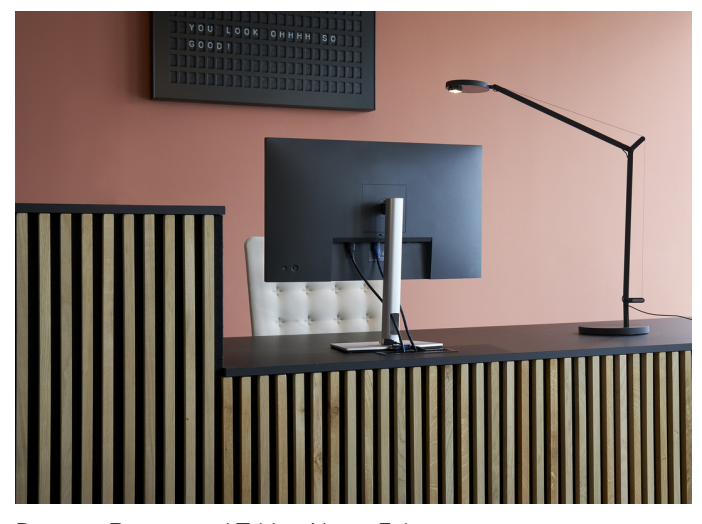
Demetra Professional Table - Naoto Fukasawa