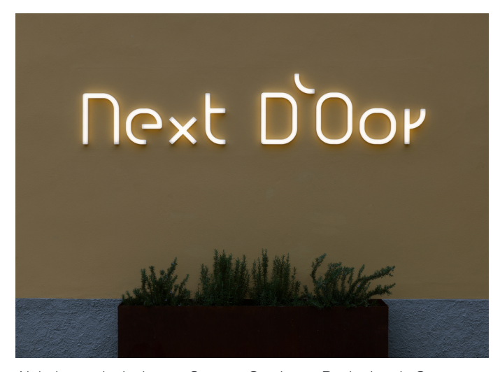
Alphabet of Light Letter Custom Outdoor - Bjarke Ingels Group