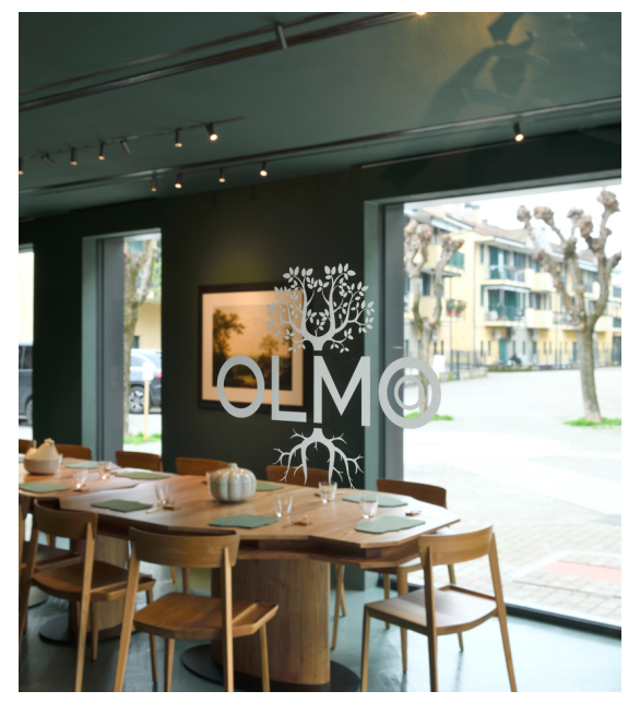
Turn Around + Vector - Carlotta de Bevilacqua

Année / 2024 Catégorie / Hospitality